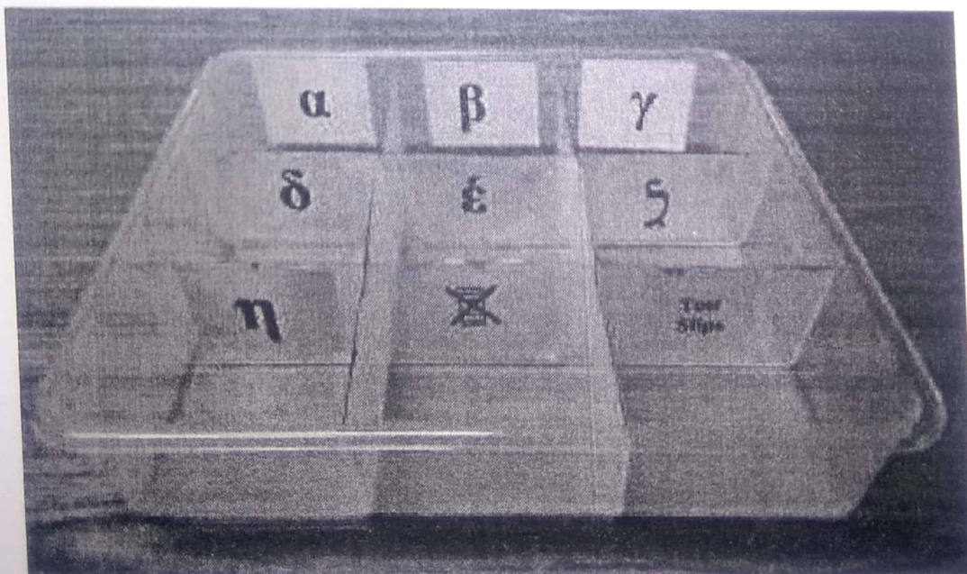
Sample Pigeonholes (Size of each compartment 6 inch X 4 inch X 4 inch)